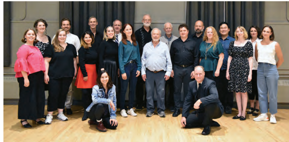
Pacific Opera Chorus and Supernumeraries