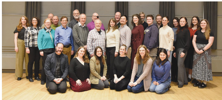
Pacific Opera Chorus and Supernumeraries

* Appearing with permission of the Canadian Actors' Equity Association